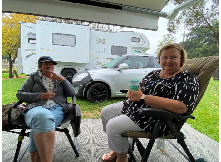
Soft rainy overcast days did not stop morning and afternoon tea ceremonies