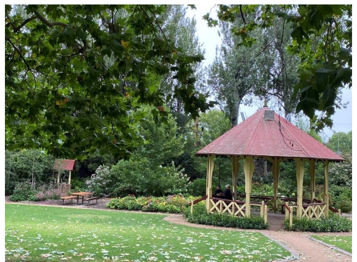
Moss Vale is known for its beautiful gardens