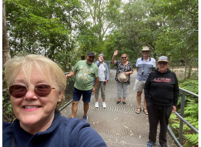
Sunny days were spent sight seeing.