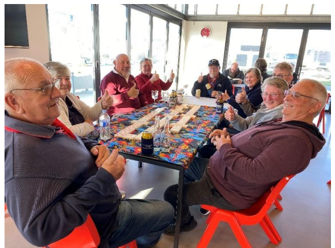
The camp kitchen was well used by the group.