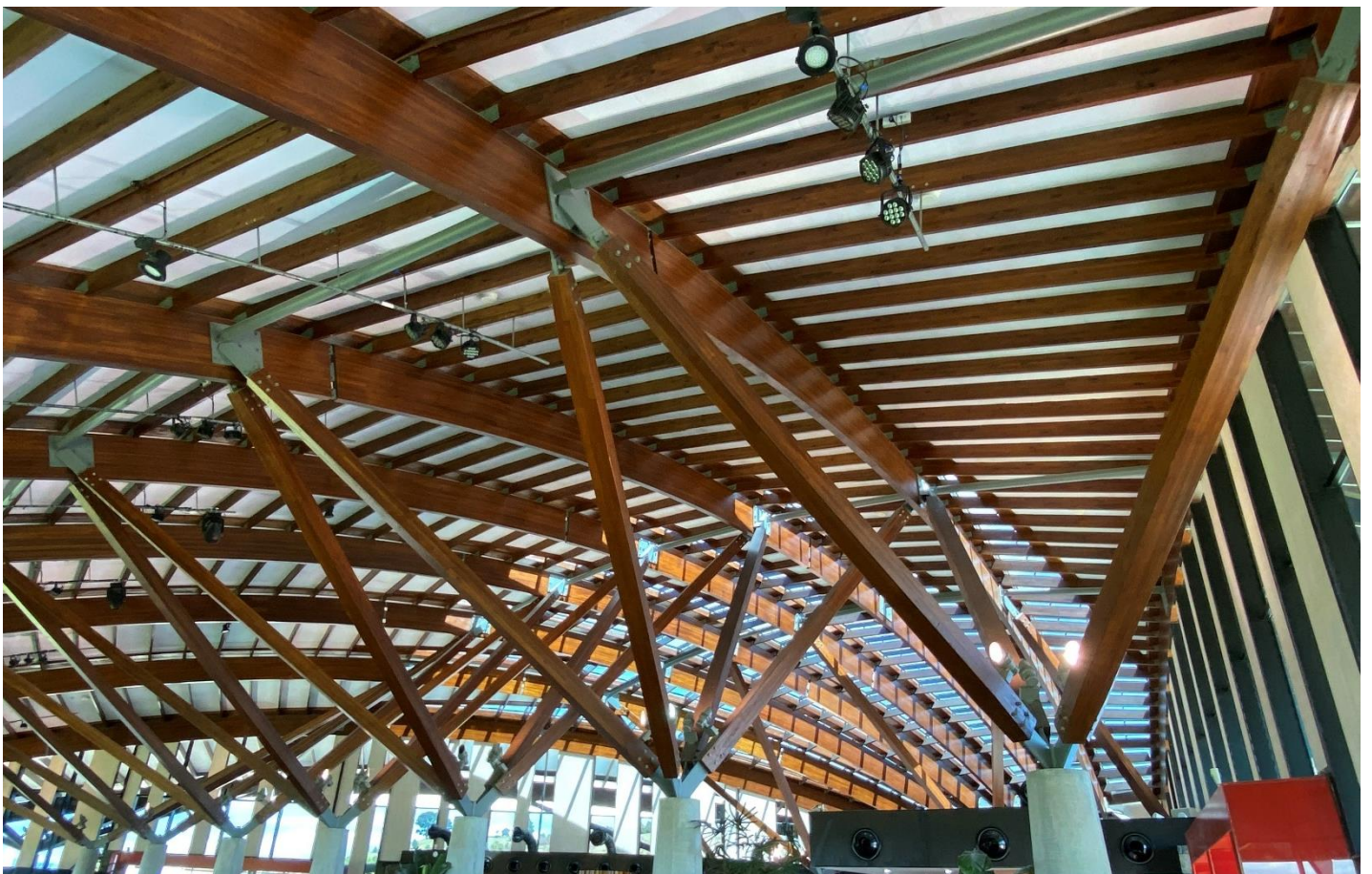
The impressive roof structure of the Arboretum