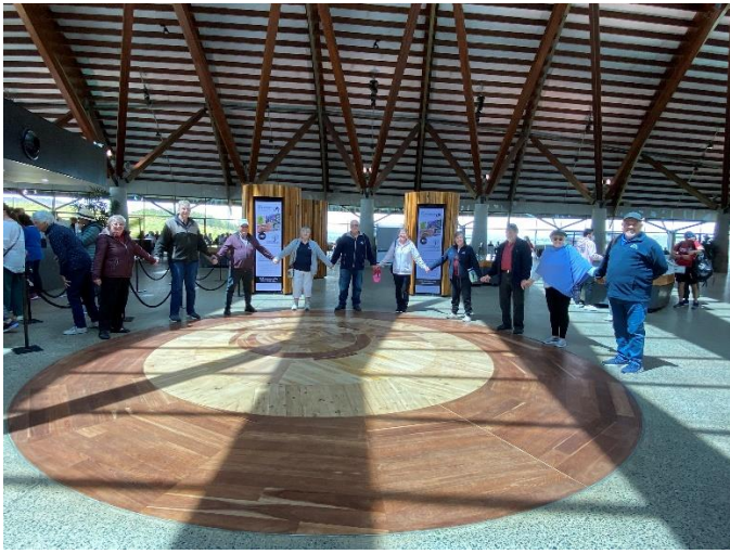
Inside the Arboretum with the centrepiece representing the growth rings of a tree