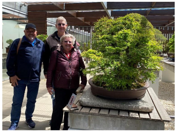
Look but do not touch!