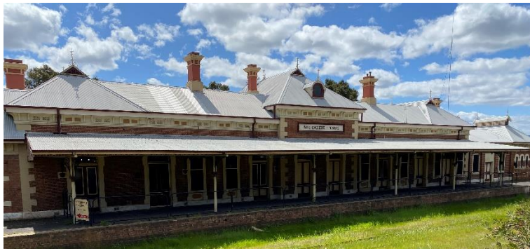
The old Mudgee Railway Station which housed the Arts and Crafts Centre