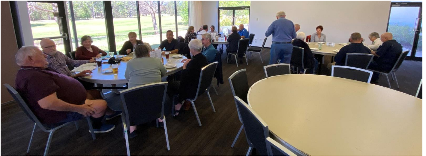
Lunch at the bowling club