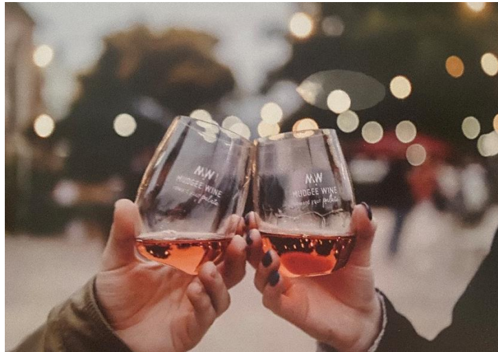
The food and wine festival was the drawcard for the week