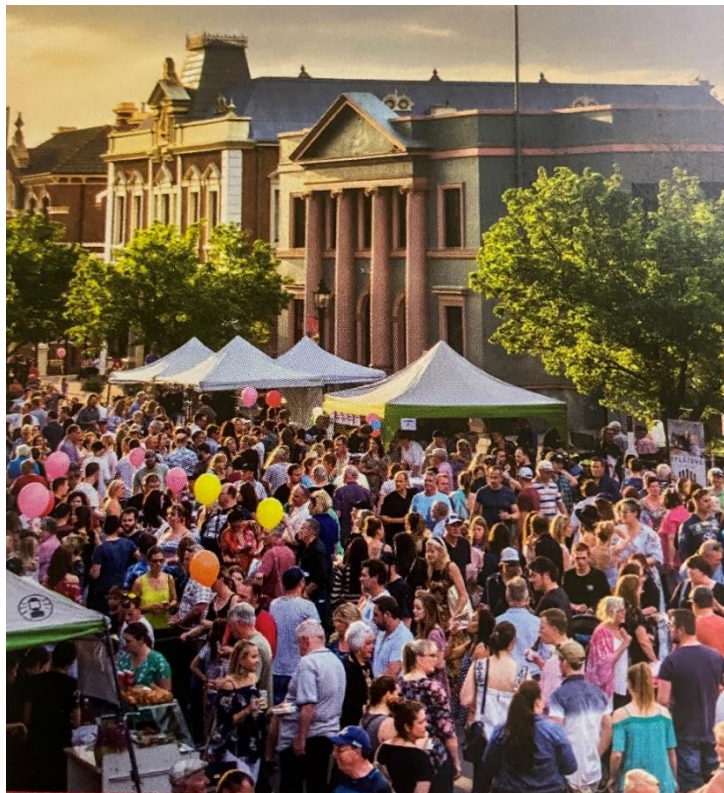
There was a large crowd and the weather was kind to us.