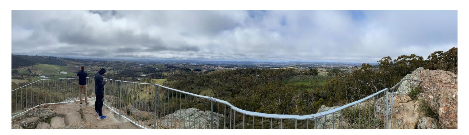
The view from The Pinnical Lookout