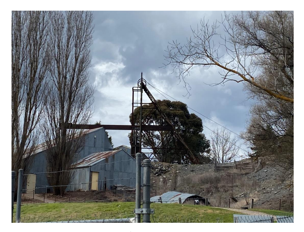
The poppet head for Wentworth Mine, Locknow.

Over a four year period during the 1880's, 6 tons of gold was extracted from the area.