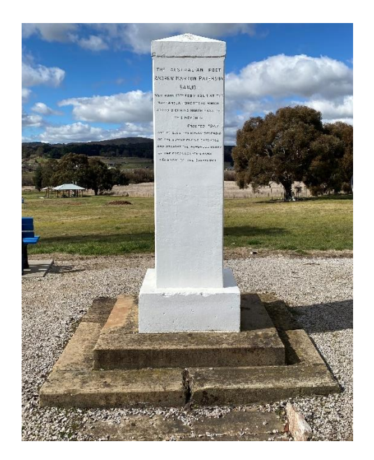
No visit to Orange is complete without a visit to the birthplace of Banjo Paterson