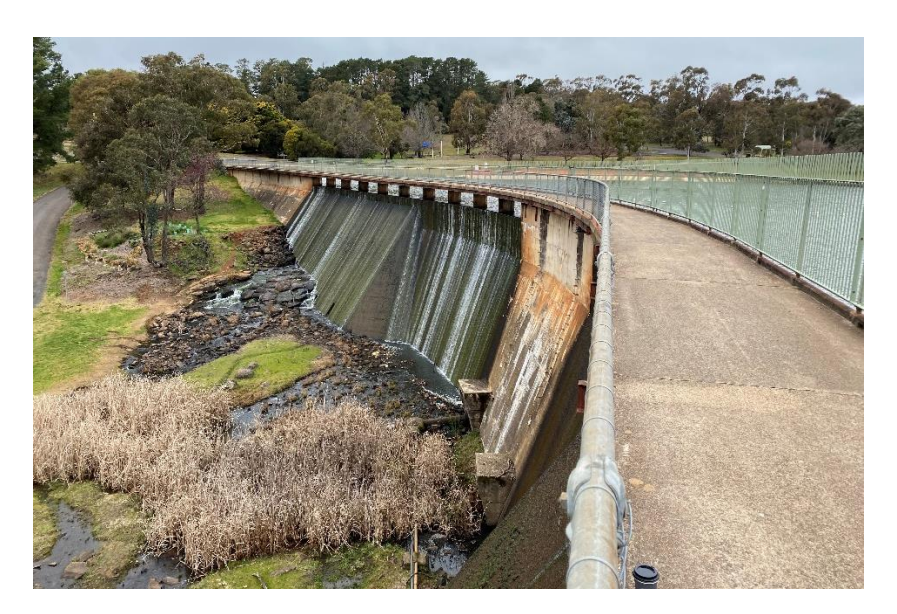
Lake Canobolas was previously Orange water supply.