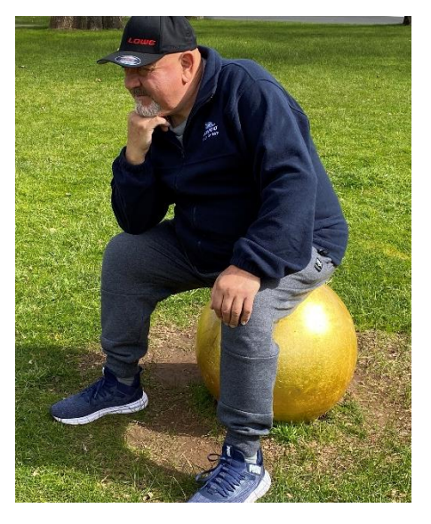
We are not sure what he is thinking.