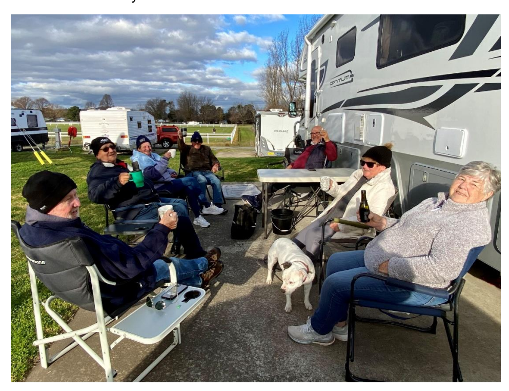
Afternoon tea was a chilly affair, and the cold temperatures caused us to retreat to our vans