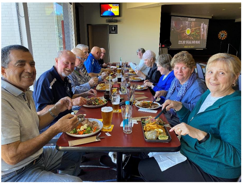
Lunch was enjoyed at the North Haven Bowling Club

This was followed by coffee and cake to sustain the group on the walk back to the park.