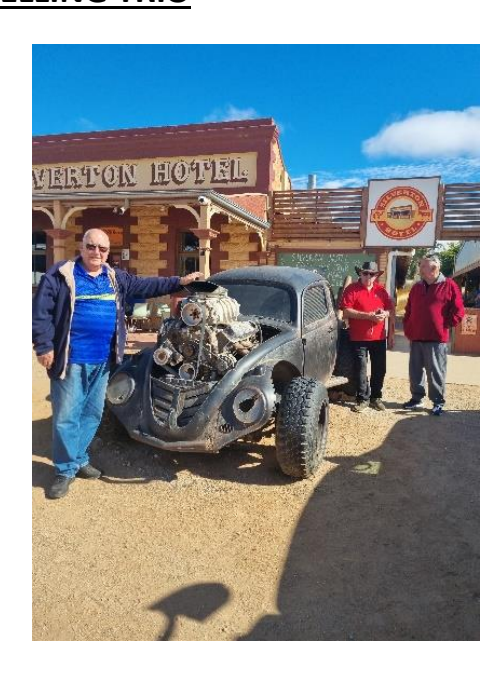
Boys & their toys Silverton