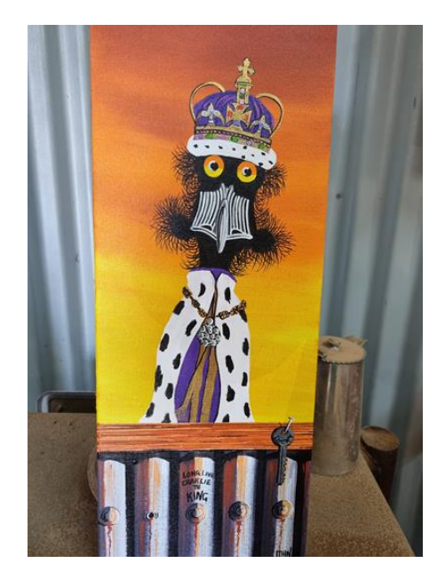
King Charles Silverton