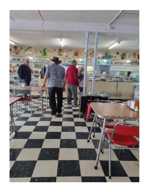
Bells 60's Milk Bar Broken Hill

Three brothers age 92, 94 and 96 live in a house together.