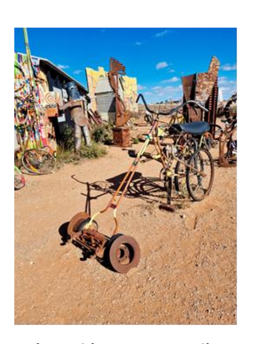
Modern Ride on Mower Silverton