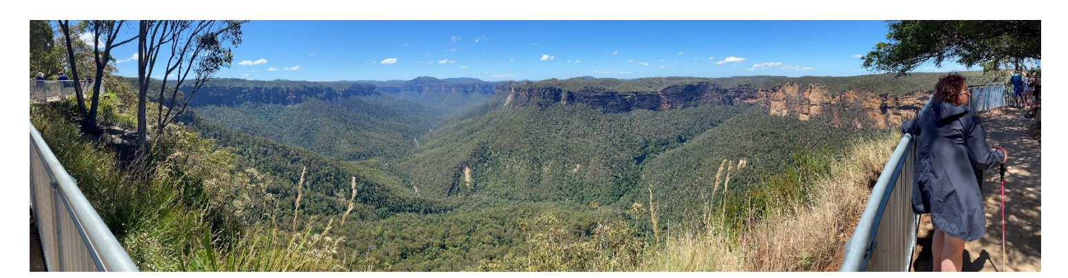
Evans Lookout Blackheath