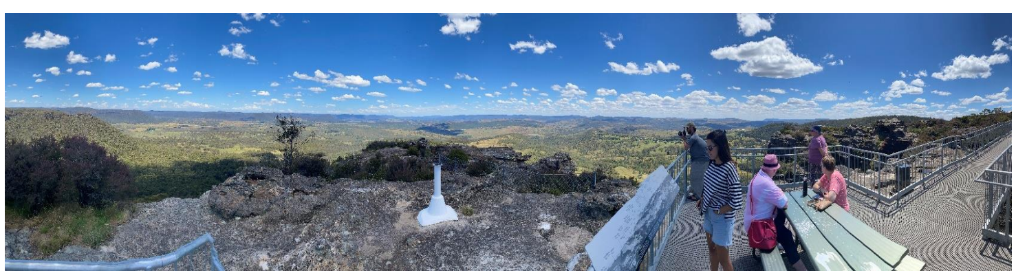
Hassans Walls Lookout Lithgow