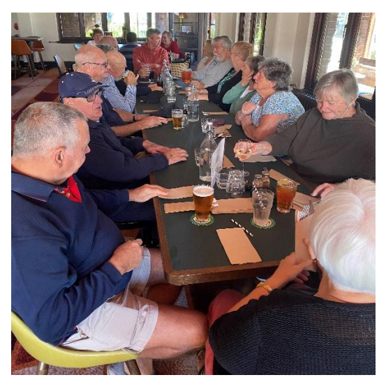
Lunch at the New Ivanhoe Hotel